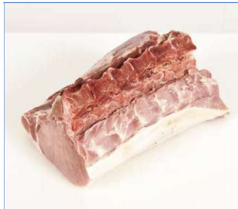
5 ... as illustrated.