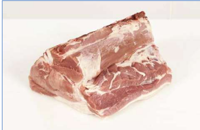
2 The fillet section (lumbar) of the loin is used for this cut.