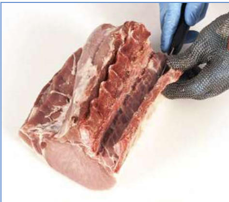
4 Remove the feather bones ...