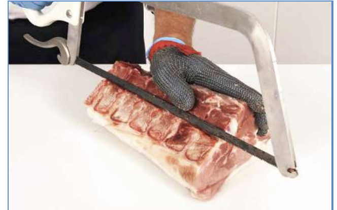
3 Saw through the feather bones as illustrated taking care not to damage the loin muscles.