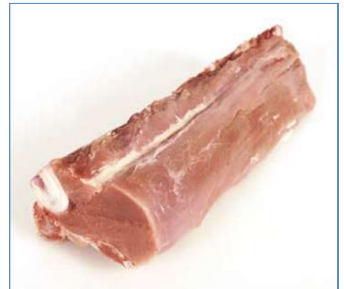
7 Fillet on the bone.