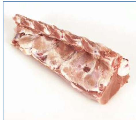
6 Remove the fillet with bones attached.